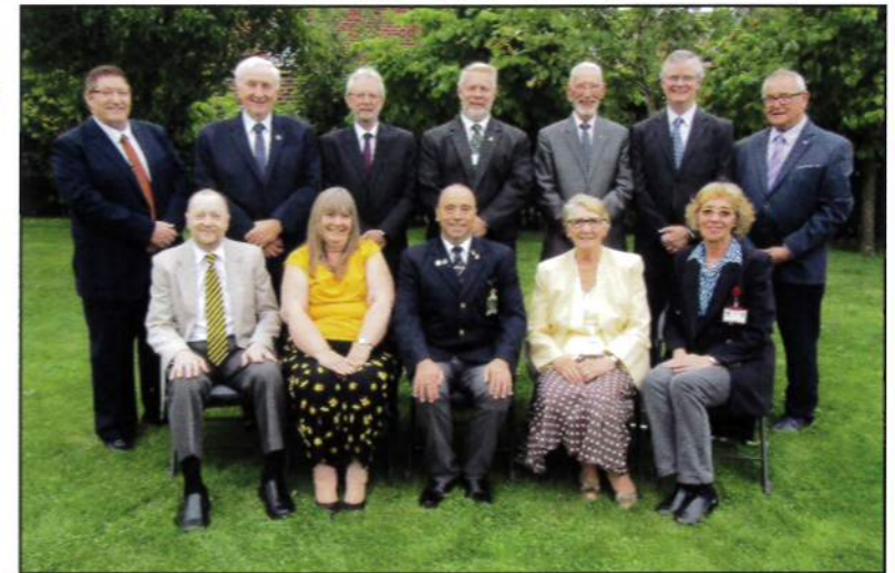
Bridlington Town Councillors presented at all the Primary Schools of Bridlington

Spare coins were given out from the office in return for a donation of £1.00 each and a total of £747.00 has been raised for the Mayor's charities. Thank you to all who donated. These events were supported by the East Riding of Yorkshire Councils Queen's Platinum Jubilee Community Fund.