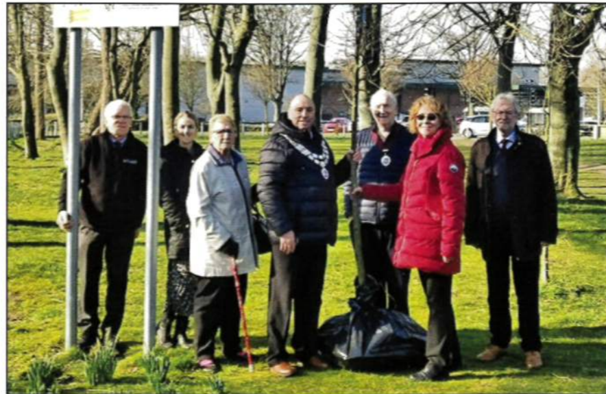
Bridlington Town Councillors planting a tree for the Queens Platinum Jubilee with ERYC.

If you are thinking about planning a street party, with road closures, you would need permission from the East Riding of Yorkshire Council and you can register your interest by emailing rod.towse@eastriding.gov.uk or george.ward@eastriding.gov.uk and as soon as they are ready you will be provided with guidelines and an application to close roads for your party.